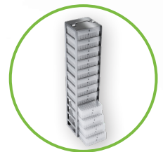
Optimal storage capacity and overview of the stored samples with the stainless steel front rack storage system