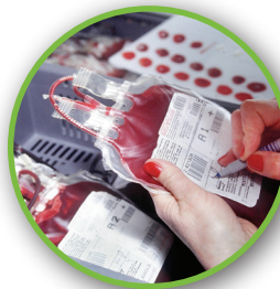
Arctiko's Blood bank refrigerator range is MDD 93/42/EEC approved and certified as class IIA