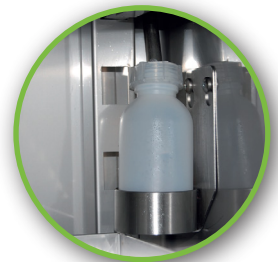
The BBR range comes with probes immersed in glycerin, extra security controller, chart recorder and secondary probes.