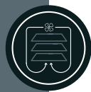
FORCED AIR COOLING