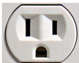
110V wall socket